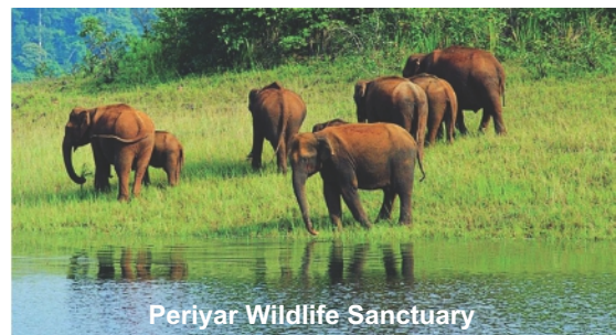
Periyar Wildlife Sanctuary