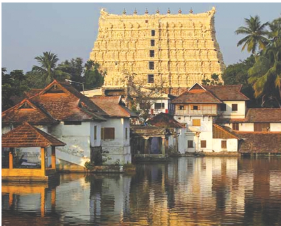
Sri Padmanabha Swamy Temple

Located at the south-western tip of Indian subcontinent, Thiruvananthapuram, which is also known as Trivandrum is a calm, beautiful and quiet city. It is the capital of Kerala (God's own country), which has a long coast line full of coconut trees and is much-sought-after tourist destination. The major attractions in Trivandrum are lakes, beaches, palaces, temples, museum and zoo. The world famous Kovalam beach and Sri Padmanabha Swamy Temple are in Trivandrum. Another major tourist spot, Kanyakumari, is about 95 km south of Trivandrum. Padmanabhapuram Palace (55km) and Suchindram Temple (73 km) are on the way to Kanyakumari. Another important tourist spot north of Thiruvananthapuram is Varkala beach (50 km).