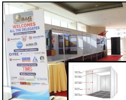
Past Conference Exhibition & Visual Scheme

At the venue of IBAAS conference, exhibition is being organized showcasing the developments of aluminium industry in India and world over. Fully furnished aluminium framed stalls of 2mx2m size would be available for interested companies. More than 200 delegates from India and abroad are expected to participate in this International mega event. The tariff for exhibition stall is as follows: