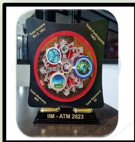
Table V (Memento presented to IIM HO)

Council passed the following Resolution for Closure of IIM-ATM 2023 Bank Account.